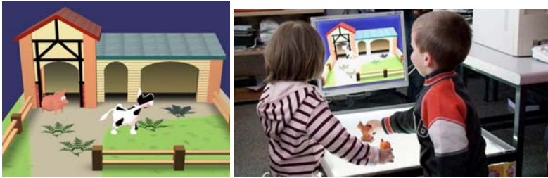
Fig. 2. The "Collecting strawberries" game

A competitive game, "Collecting strawberries", was used to detect interaction problems. The 3D scenery is a field with several plants (see fig. 2). Each of the two players chooses one farm animal to play with. Some plants hide strawberries and children compete for collecting them. To do this, children have to move the toy animals onto a plant location. Here, we will briefly explain the problems observed during the test sessions, grouped by the SEEM category, and the solutions that were carried out to solve them.